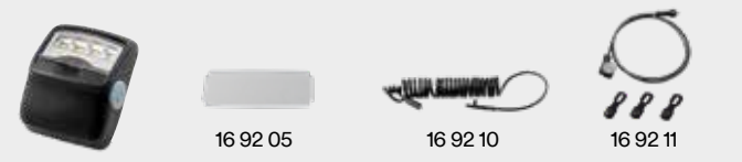
16 92 00

We offer numerous accessories so you can configure your 3M™ Speedglas™ Welding Helmet G5-01 to meet your individual preferences and application needs.