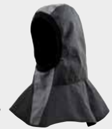
16 91 00