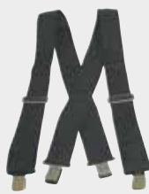
83 50 20