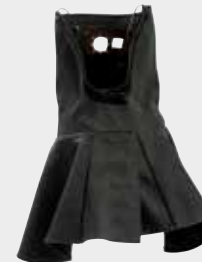
16 90 30