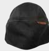
16 90 23