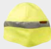
16 90 21